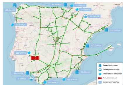
Configuration of a case study of the Spanish Gas Network

The software helps when making strategic decisions for the company, which reduces costs. In addition, it is competitive with existing commercial tools since it presents a great advantage for the company: control over future developments, tariff calculations and can incorporate new features on demand.